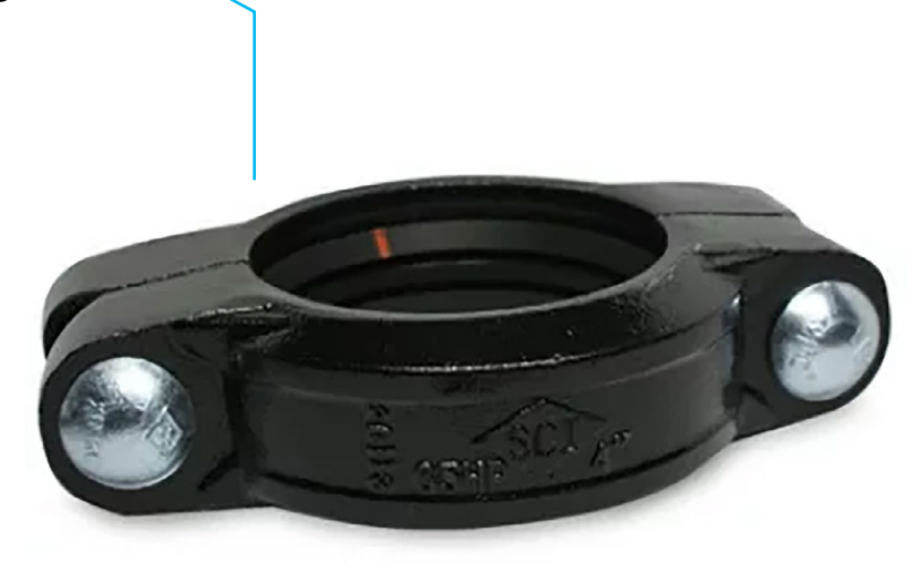
Figure 65HP–ES couplings with End Shield gaskets are designed for use in high pressure piping systems with working pressure ratings up to 2,500 psi.*

Working Pressure and End Load values are based on "End Shield" cut or roll grooved extra heavy steel pipe.